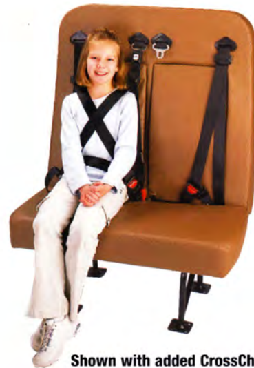
Shown with added CrossChex™ harness for additional securement